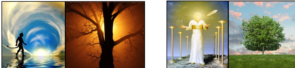
Depiction of the Tree of Knowledge of Good & Evil AND the Tree of Life

Genesis 2:8-9, 16-17 And the LORD God planted a garden eastward in Eden; and there he put the man whom he had formed. (9) And out of the ground made the LORD God to grow every tree that is pleasant to the sight, and good for food; the tree of life also in the midst of the garden, and the tree of knowledge of good and evil. 16 And the LORD God commanded the man, saying, Of every tree of the garden thou mayest freely eat: (17) But of the tree of the knowledge of good and evil, thou shalt not eat of it: for in the day that thou eatest thereof thou shalt surely die.