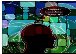
"Keep the Commandments of God"

Psalms 51:1-10 Have mercy upon me, O God, according to thy lovingkindness: according unto the multitude of thy tender mercies blot out my transgressions. (2) Wash me thoroughly from mine iniquity, and cleanse me from my sin. (3) For I acknowledge my transgressions: and my sin [is] ever before me. (4) Against thee, thee only, have I sinned, and done [this] evil in thy sight: that thou mightest be justified when thou speakest, [and] be clear when thou judgest. (5) Behold, I was shapen in iniquity; and in sin did my mother conceive me. (6) Behold, thou desirest truth in the inward parts: and in the hidden [part] thou shalt make me to know wisdom. (7) Purge me with hyssop, and I shall be clean: wash me, and I shall be whiter than snow. (8) Make me to hear joy and gladness; [that] the bones [which] thou hast broken may rejoice. (9) Hide thy face from my sins, and blot out all mine iniquities. (10) Create in me a clean heart, O God; and renew a right spirit within me.