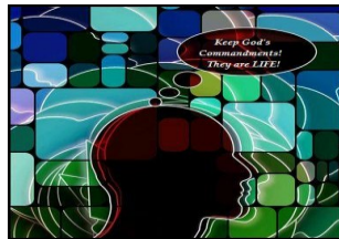
"Keep the Commandments of God"

Psalms 51:1-10 Have mercy upon me, O God, according to thy lovingkindness: according unto the multitude of thy tender mercies blot out my transgressions. (2) Wash me thoroughly from mine iniquity, and cleanse me from my sin. (3) For I acknowledge my transgressions: and my sin [is] ever before me. (4) Against thee, thee only, have I sinned, and done [this] evil in thy sight: that thou mightest be justified when thou speakest, [and] be clear when thou judgest. (5) Behold, I was shapen in iniquity; and in sin did my mother conceive me. (6) Behold, thou desirest truth in the inward parts: and in the hidden [part] thou shalt make me to know wisdom. (7) Purge me with hyssop, and I shall be clean: wash me, and I shall be whiter than snow. (8) Make me to hear joy and gladness; [that] the bones [which] thou hast broken may rejoice. (9) Hide thy face from my sins, and blot out all mine iniquities. (10) Create in me a clean heart, O God; and renew a right spirit within me.