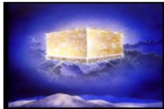
Depiction of New Jerusalem, the Kingdom of God, the Father

Prayer: Psalms 86:9-13 All nations whom thou hast made shall come and worship before thee, O Lord; and shall glorify thy name. (10) For thou art great, and doest wondrous things: thou art God alone. (11) Teach me thy way, O LORD; I will walk in thy truth: unite my heart to fear thy name. (12) I will praise thee, O Lord my God, with all my heart: and I will glorify thy name for evermore. (13) For great is thy mercy toward me: and thou hast delivered my soul from the lowest hell.