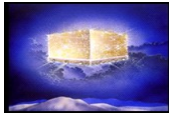
Depiction of New Jerusalem, the Kingdom of God, the Father

Prayer: Psalms 86:9-13 All nations whom thou hast made shall come and worship before thee, O Lord; and shall glorify thy name. (10) For thou art great, and doest wondrous things: thou art God alone. (11) Teach me thy way, O LORD; I will walk in thy truth: unite my heart to fear thy name. (12) I will praise thee, O Lord my God, with all my heart: and I will glorify thy name for evermore. (13) For great is thy mercy toward me: and thou hast delivered my soul from the lowest hell.