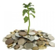
Seeds by the Way Side

Mark 4:15 And these are they by the way side, where the word is sown; but when they have heard, Satan cometh immediately, and taketh away the word that was sown in their hearts.