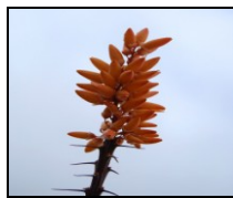
Seeds Sown Among Thorns

Mark 4:18-19 And these are they which are sown among thorns; such as hear the word, (19) And the cares of this world, and the deceitfulness of riches, and the lusts of other things entering in, choke the word, and it becometh unfruitful.