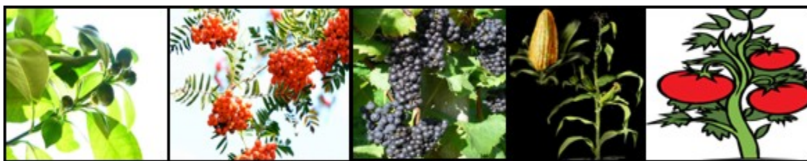
Seeds Sown on Good Ground

Mark 4:20 And these are they which are sown on good ground; such as hear the word, and receive it , and bring forth fruit, some thirtyfold, some sixty, and some an hundred.