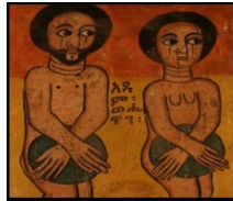
Depiction of Adam & Eve

Prayer: Psalms 23:1-6 The LORD is my shepherd; I shall not want. (2) He maketh me to lie down in green pastures: he leadeth me beside the still waters. (3) He restoreth my soul: he leadeth me in the paths of righteousness for his name's sake. (4) Yea, though I walk through the valley of the shadow of death, I will fear no evil: for thou art with me; thy rod and thy staff they comfort me. (5) Thou preparest a table before me in the presence of mine enemies: thou anointest my head with oil; my cup runneth over. (6) Surely goodness and mercy shall follow me all the days of my life: and I will dwell in the house of the LORD for ever.