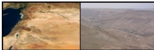
Desert & Arnon River in Jordan (Place of Safety)

Psalms 91:1, 3-11 He that dwelleth in the secret place of the most High shall abide under the shadow of the Almighty. [3] Surely he shall deliver thee from the snare of the fowler, and from the noisome pestilence. [4] He shall cover thee with his feathers, and under his wings shalt thou trust: his truth shall be thy shield and buckler. [5] Thou shalt not be afraid for the terror by night; nor for the arrow that flieth by