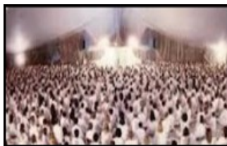
The Great Multitude in White Robes