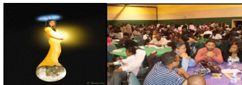
The Woman is ISRAEL, the Church of God

Revelation 12:1 And there appeared a great wonder in heaven; a woman clothed with the sun, and the moon under her feet, and upon her head a crown of twelve stars: