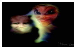
Beast & False Prophet

Isaiah 66:16-24 For by fire and by his sword will the LORD plead with all flesh: and the slain of the LORD shall be many. (17) They that sanctify themselves, and purify themselves in the gardens behind one tree in the midst, eating swine's flesh, and the abomination, and the mouse, shall be consumed together, saith the LORD. (18) For I know their works and their thoughts: it shall come, that I will gather all nations and tongues; and they shall