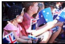
Gentiles (Europeans/White people)

Prayer: Psalms 36:1-7 The transgression of the wicked saith within my heart, that there is no fear of God before his eyes. (2) For he flattereth himself in his own eyes, until his iniquity be found to be hateful. (3) The words of his mouth are iniquity and deceit: he hath left off to be wise, and to do good. (4) He deviseth mischief upon his bed; he setteth himself in a way that is not good; he abhorreth not evil. (5) Thy mercy, O LORD, is in the heavens; and thy faithfulness reacheth unto the clouds. (6) Thy righteousness is like the great mountains; thy judgments are a great deep: O LORD, thou preservest man and beast. (7) How excellent is thy lovingkindness, O God! therefore the children of men put their trust under the shadow of thy wings.