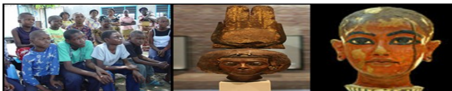
Hamites (Africans/Ethiopians/Nubians) Egyptian Queen Tyre Tutankhamen (the boy king)

Genesis 10:7-14 And the sons of Cush; Seba, and Havilah, and Sabtah, and Raamah, and Sabtecha: and the sons of Raamah; Sheba, and Dedan. (8) And Cush begat Nimrod: he began to be a mighty one in the earth. (9) He was a mighty hunter before the LORD: wherefore it is said, Even as Nimrod the mighty hunter before the LORD. (10) And the beginning of his kingdom was Babel, and Erech, and Accad, and Calneh, in the land of Shinar. (11) Out of that land went forth Asshur, and builded Nineveh, and the city Rehoboth, and Calah, (12) And Resen between Nineveh and Calah: the same [is] a great city. (13) And Mizraim begat Ludim, and Anamim, and Lehabim, and Naphtuhim, (14) And Pathrusim, and Casluhim, (out of whom came Philistim,) and Caphtorim.