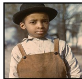
African American (Israelite)