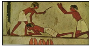
Egyptian beating an Israelite slave (Notice that all of them are Black)