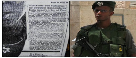
Falashans (Danites, a tribe of Israel that dwells in Ethiopia) also known as Beta Israel