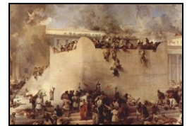
Fall of Jerusalem in 70 AD

Isaiah 5:1-7 Now will I sing to my wellbeloved a song of my beloved touching his vineyard. My wellbeloved hath a vineyard in a very fruitful hill: (2) And he fenced it, and gathered out the stones thereof, and planted it with the choicest vine, and built a tower in the midst of it, and also made a winepress therein: and he looked that it should bring forth grapes, and it brought forth wild grapes. (3) And now, O inhabitants of Jerusalem, and men of Judah, judge, I pray you, betwixt me and my vineyard. (4) What could have been done more to my vineyard, that I have not done in it? wherefore, when I looked that it should bring forth grapes, brought it forth wild grapes? (5) And now go to; I will tell you what I will do to my vineyard: I will take away the hedge thereof, and it shall be eaten up; and break down the wall thereof, and it shall be trodden down: (6) And I will lay it waste: it shall not be pruned, nor digged; but there shall come up briers and thorns: I will also command the clouds that they rain no rain upon it. (7) For the vineyard of the LORD of hosts is the house of Israel, and the men of Judah his pleasant plant: and he looked for judgment, but behold oppression; for righteousness, but behold a cry.