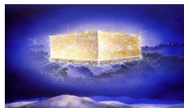
Depiction of New Jerusalem