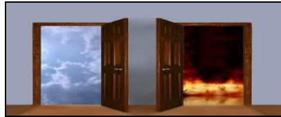
LIFE or DEATH