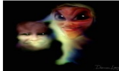
Beast & False Prophet in Lake of Fire