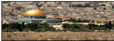
Israel's Resting Place