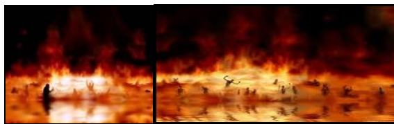
Satan, the unholy angels and sinners in Lake of Fire