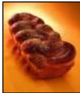
Puffed up = Old Leaven (Sin)

1 Corinthians 5:7 Purge out therefore the old leaven, that ye may be a new lump, as ye are unleavened. For even Christ our passover is sacrificed for us: